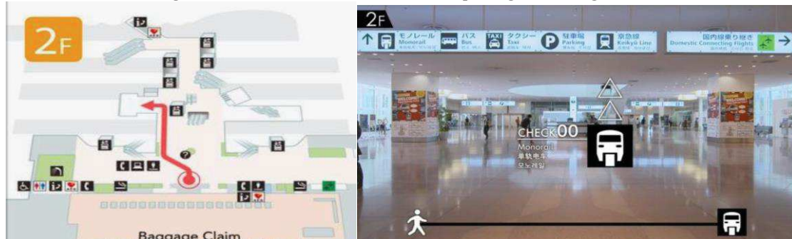
An example of the display monitors broadcasting information on transport

Under the banner and logo, "Japan. Endless Discovery" used by the Japan Tourism Agency when publicizing inbound tourism in markets around the world, the messages will also contain the message that we are striving to present an airport that offers the ultimate in convenience, reliability and excitement to encourage visitors from abroad to come to Japan again and again.