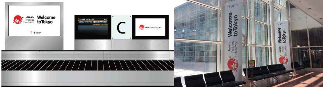
Welcome messages on monitors in the 2nd floor baggage claim area and the arrival lobby

— Expressing a Warm Welcome to Passengers from Abroad —