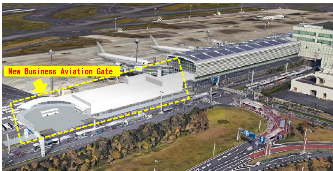
(Rendering of completed facility)

We are pleased to announce the construction of a new business aviation gate to go into service at Terminal 3 at New Tokyo International Airport (Haneda Airport) in July this year. This will enable the airport to provide improved convenience and meet the growing demand for business jets in the run up to the Tokyo Olympics and Paralympics.