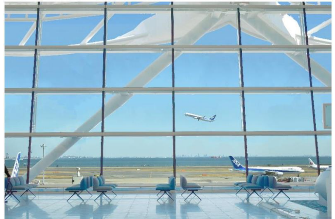
Terminal 2 international departure lobby (exterior and interior view)

Japan Airport Terminal Co., Ltd. and Tokyo International Air Terminal Corporation (referred to collectively below as "the Corporate Group") are to reopen Terminal 2 (international common use area) on 19 July 2023 after it was closed due to the COVID pandemic.